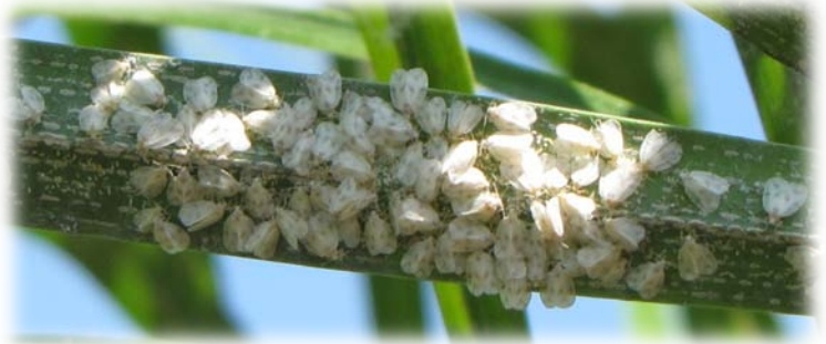
Adults on the underside of a palm leaflet.

But DON'T panic. This whitefly is different from the ficus whitefly. So far, the gumbo limbo spiraling whitefly is not causing severe plant damage such as plant death or severe branch die-back.