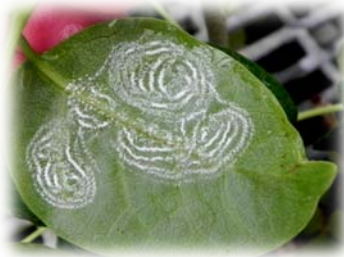
Eggs are laid in spirals.

But DON'T panic. This whitefly is different from the ficus whitefly. So far, the gumbo limbo spiraling whitefly is not causing severe plant damage such as plant death or severe branch die-back.